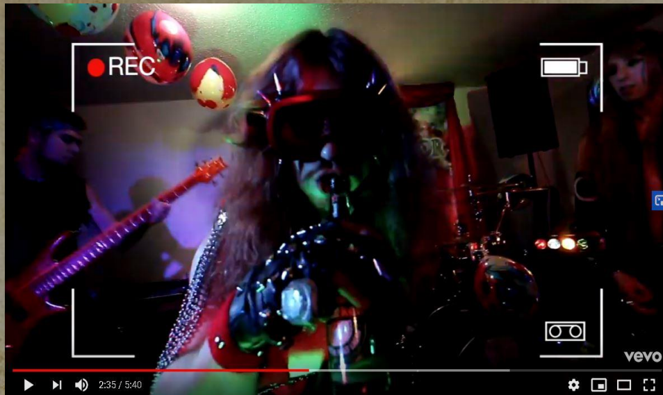
CASTER VOLOR - Party Rock Anthem [Official Music Video] (LMFAO Cover)