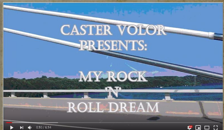
CASTER VOLOR - My Rock 'N' Roll Dream (Official Video)