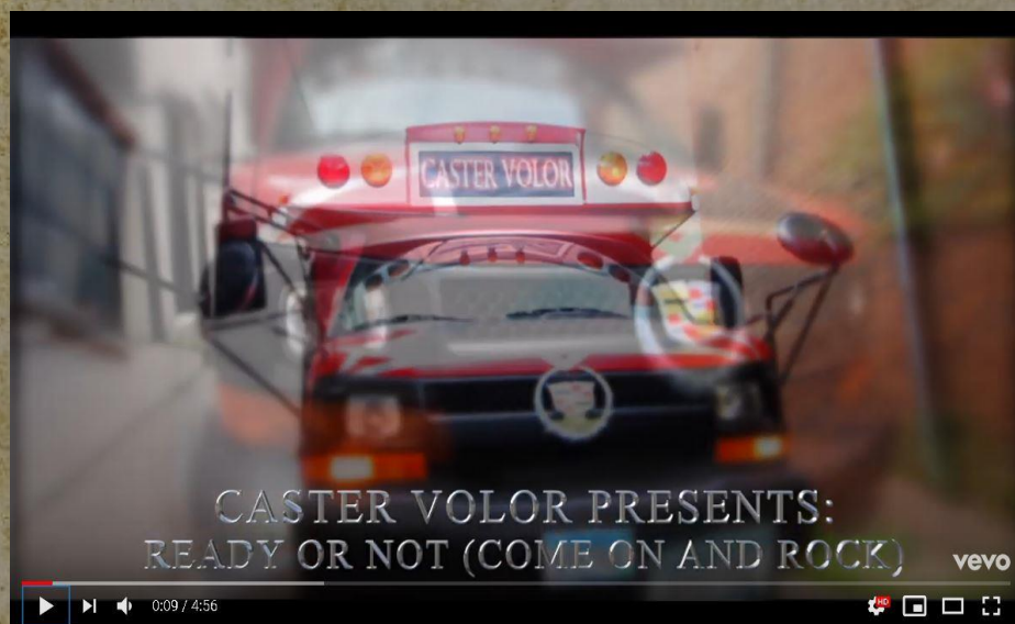
Caster Volor - Ready or Not Come on and Rock