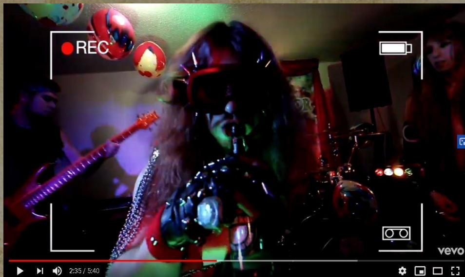
CASTER VOLOR - Party Rock Anthem [Official Music Video] (LMFAO Cover)