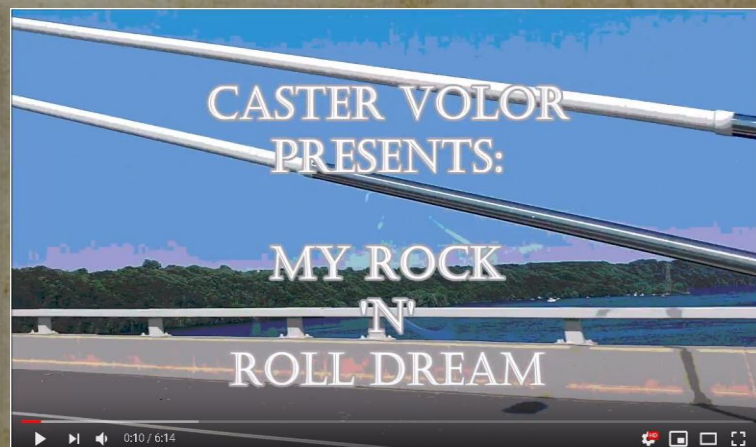
CASTER VOLOR - My Rock 'N' Roll Dream (Official Video)