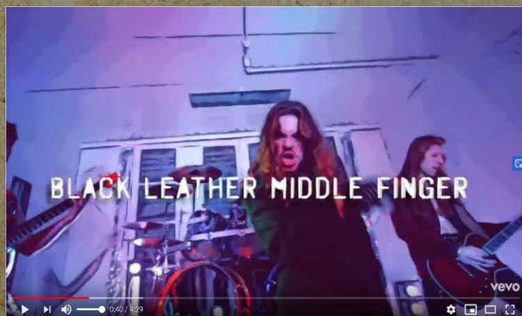
CASTER VOLOR - Black Leather Middle Finger [Official Music Video]